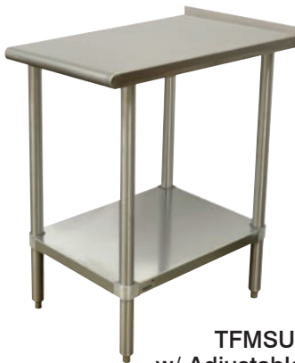
TFMSU Series w/ Adjustable Undershef