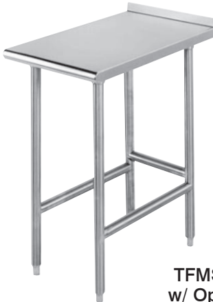
TFMS Series w/ Open Base